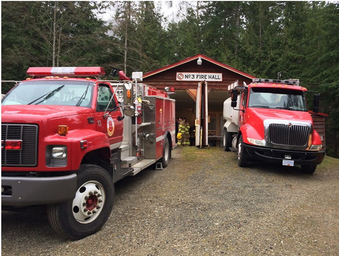
Lund fire hall